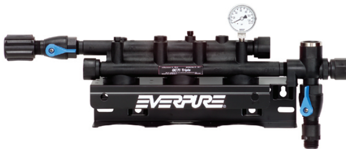
QC71 Triple Parallel Head: EV9272-23

Engineered for durability, strength and longevity. Will not corrode